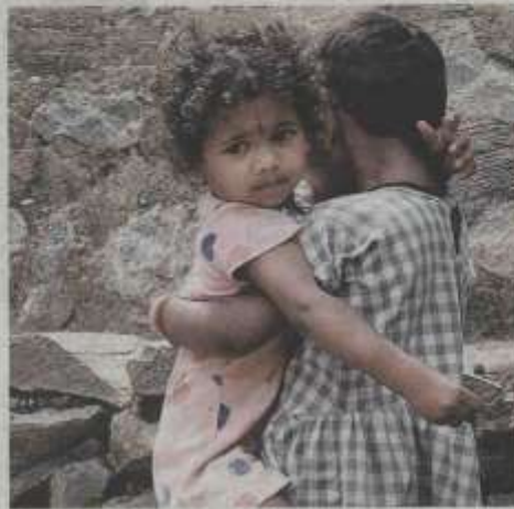
Mars and Tata Trusts said they would collaborate on reducing Aflatoxin contamination in India's supply chain.

"Given Mars' global leadership in nutritive foods and sustainable agriculture, Tata Trusts believes this collaboration would have lasting, meaningful benefits for Indian communities," said Ratan