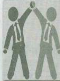
PARTNERSHIP: Mars intends to conduct joint research with Tata.

plan to collaborate on reducing Aflatoxin contamination in India's supply chain. Aflatoxin is a naturally occurring, poisonous chemical produced by certain molds - is a critical food safety issue in India.