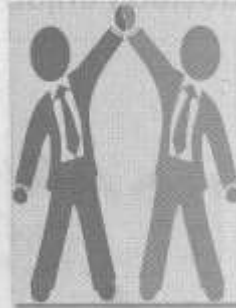
PARTNERSHIP: Mars intends to conduct joint research with Tata

plan to collaborate on reducing Aflatoxin contamination in India's supply chain. Aflatoxin is a naturally occurring, poisonous chemical produced by certain molds - is a critical food safety issue in India.