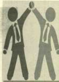
PARTNERSHIP: Mars intends to conduct joint research with Tata

plan to collaborate on reducing Aflatoxin contamination in India's supply chain. Aflatoxin is a naturally occurring, poisonous chemical produced by certain molds - is a critical food safety issue in India.