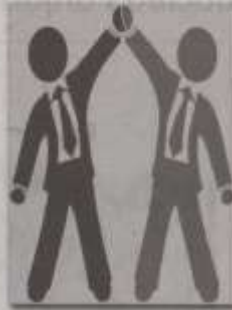
PARTNERSHIP: Mars intends to conduct joint research with Tata

plan to collaborate on reducing Aflatoxin contamination in India's supply chain. Aflatoxin is a naturally occurring, poisonous chemical produced by certain molds - is a critical food safety issue in India.