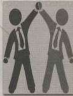
PARTNERSHIP: Mars intends to conduct joint research with Tata.

plan to collaborate on reducing Aflatoxin contamination in India's supply chain. Aflatoxin is a naturally occurring, poisonous chemical produced by certain molds - is a critical food safety issue in India.