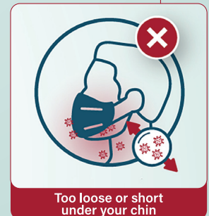
Too loose or short under your chin