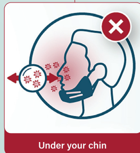
Under your chin