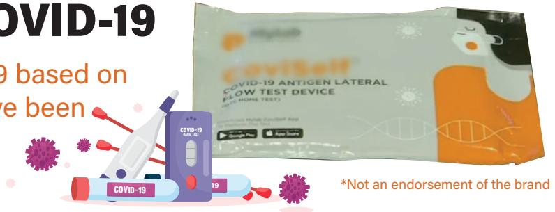
*Not an endorsement of the brand